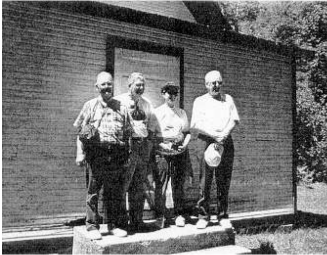
"Schoolhouse Memories"