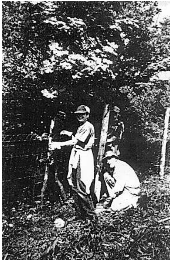
"Smiling and Building the Fence" South Manitou Island Cemetery