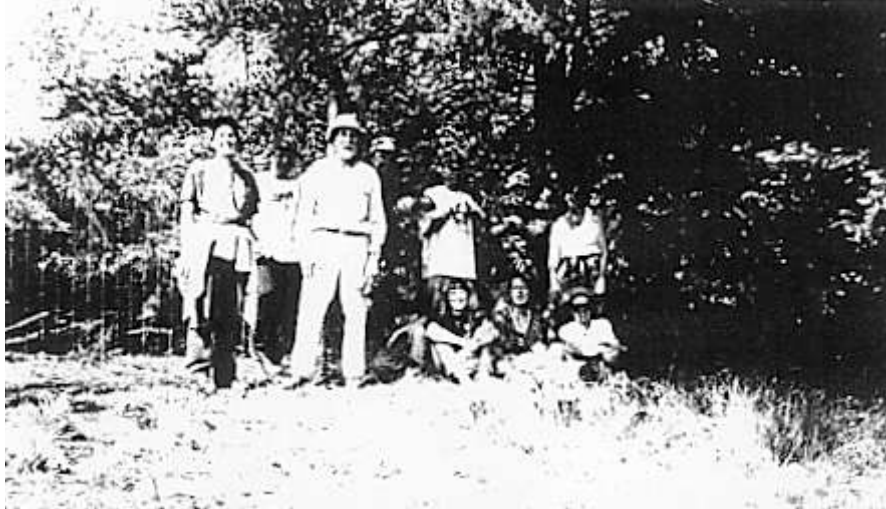
"The Cemetery fence building crew"