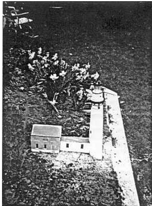
LIGHTHOUSE LAWN ORNAMENTS

The following are "recent releases" written about the Manitou Islands: